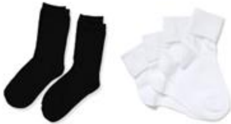
Black or White Socks