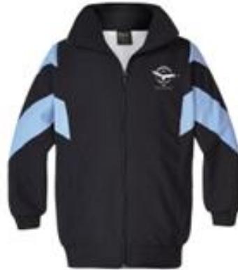
Grade 6 Jacket