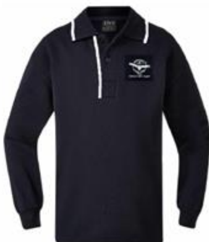
Long Sleeve Polo Shirt