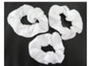
White, Navy or Maroon Scrunchie