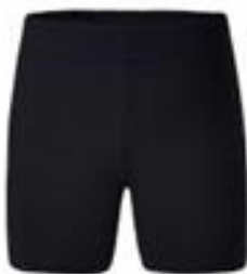
Mid Thigh Navy Bike Shorts