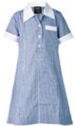
Summer Dress—Bike Shorts Underneath