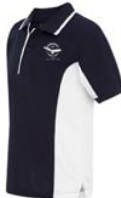
Short Sleeve Polo T-Shirt