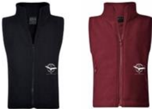
GDPS Polar Fleece Vests