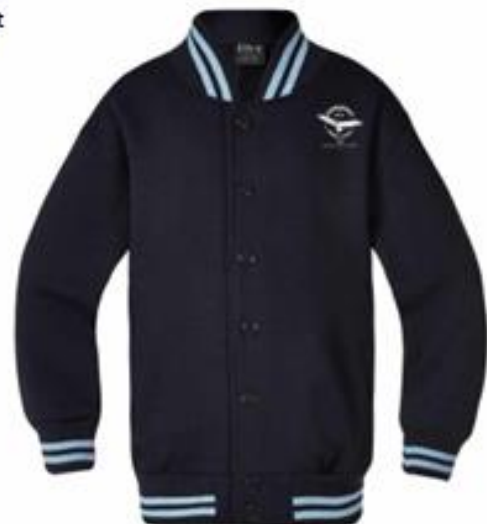
Button Up Fleecy Bomber Jacket