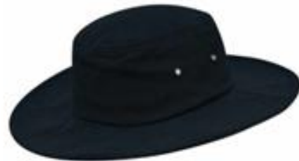
Broad Brimmed Hat—Free for Preps