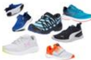
Flat Sole Shoe