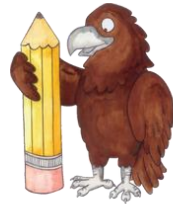
Be a Learner